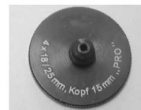
Wanit Fulgurit rivet setting tool PRO

For fixing to timber sub-construction Wanit Fulgurit facade screws 5,5 x 35/45 - K16 and sleeves have to be taken. The hole has to be diameter 7,0 mm.